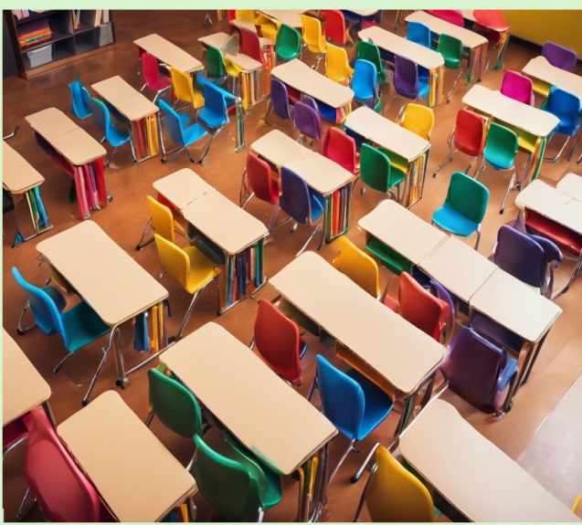
A Comprehensive Guide to Understanding and Supporting all Learners in the Classroom