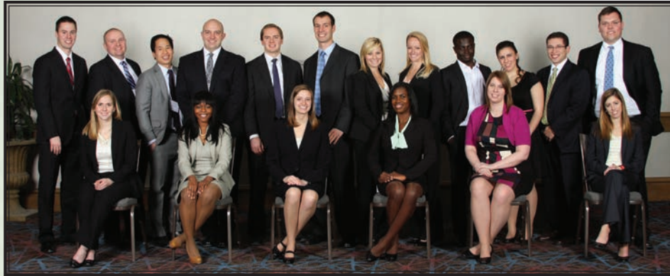
Honorable Mention Teams

Mark your calendar to attend next year's 8th Annual UAB Case Competition. -February 26 - 28, 2014