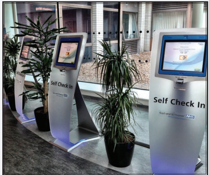
This electronic check-in system at Guy’s and St. Thomas’ outpatient clinic sparked a rich discussion. In addition to the check-in kiosks depicted here, the clinic uses electronic display boards to show whether each doctor’s clinic appointments is running on schedule, early, or behind. When the doctor is ready to see a patient, her name is displayed, along with the room to which she is to report.