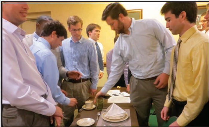
Preparing a proper place setting