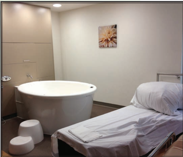
The Edinburgh Birth Center opened in October 2011 and is an entirely midwife-led facility adjacent to the Royal Infirmary of Edinburgh. The group was interested to learn that more and more women are choosing to use the birthing pools that are located in each of the six delivery rooms.