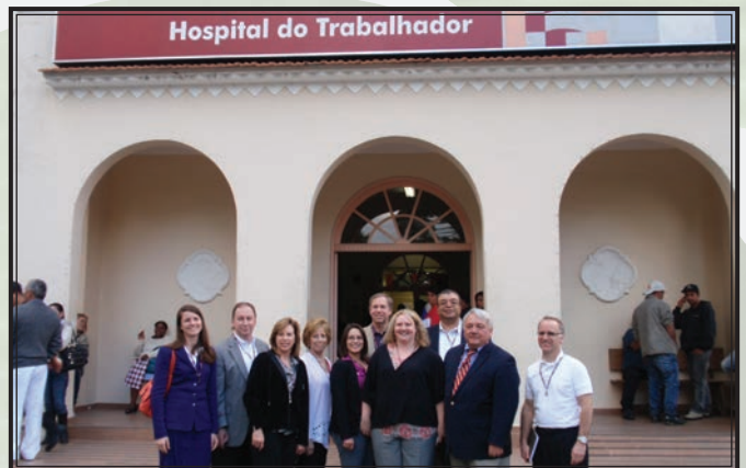
The group pauses for a quick photo after their last tour at Hospital do Trabalhador, a teaching hospital that specializes in trauma; occupational health; and maternal and child health. The hospital also houses a thirty-bed "pediatric sector" and Center for Integral Assistance of Cleft Lip and Palate.