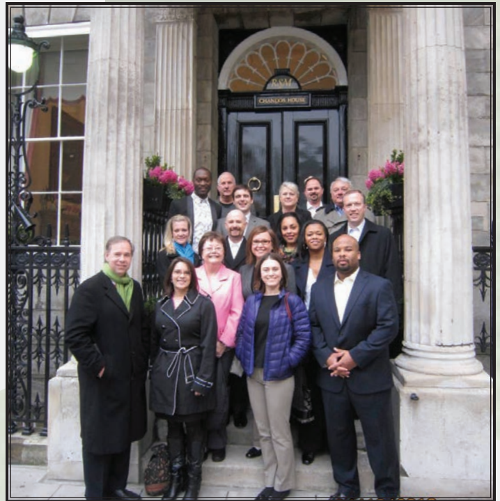
Members of Class E47 and faculty pose for a group photo in front of the Chandos House, where the students stayed during the visit to London. The Chandos House, a Georgian Townhouse built in 1771, is owned by the Royal Society of Medicine.