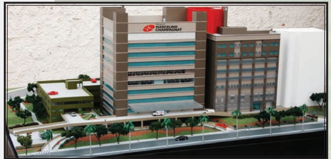
This photo depicts a model of the Hospital Marcelino Champagnat (HMC), Curitiba's "gold standard" hospital. HMC is the only private hospital in a system that owns four other large public hospitals. HCM was built to cater exclusively to private patients, but the group was fascinated to learn that the facility's profits are used to subsidize the four other not-for-profit hospitals in the system.