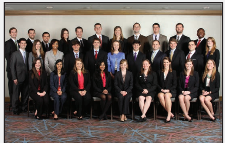
Class 48 Case Competition Ambassadors