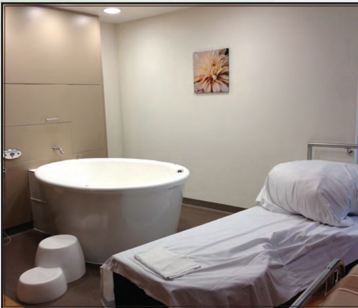
The Edinburgh Birth Center opened in October 2011 and is an entirely midwife-led facility adjacent to the Royal Infirmary of Edinburgh. The group was interested to learn that more and more women are choosing to use the birthing pools that are located in each of the six delivery rooms.