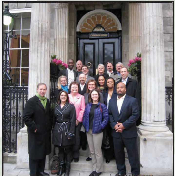
Members of Class E47 and faculty pose for a group photo in front of the Chandos House, where the students stayed during the visit to London. The Chandos House, a Georgian Townhouse built in 1771, is owned by the Royal Society of Medicine.