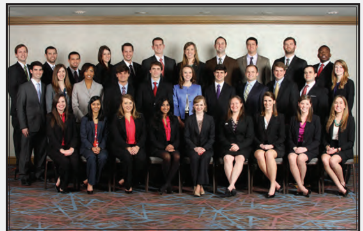
Class 48 Case Competition Ambassadors