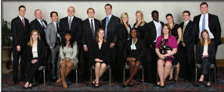
Honorable Mention Teams

Mark your calendar to attend next year's 8th Annual UAB Case Competition. -February 26 - 28, 2014