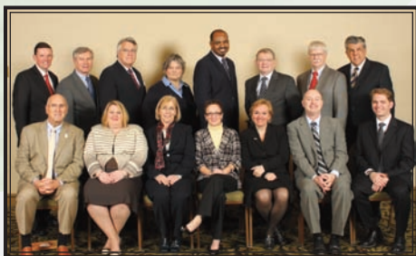
Faculty Advisers for Participating Teams

Make plans to attend next year's event on February 16, 2012 at the Wynfrey Hotel in Birmingham.