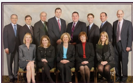
National Panel of Judges