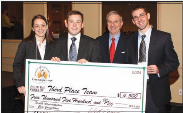
Third Place Team from UNC-Chapel Hill