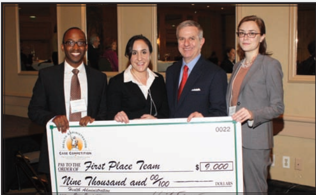
First Place Team from Baruch/Mt. Sinai College

This year’s Health Administration Case Competition was strengthened by the excellent teams representing schools from around the country as well as the national panel of judges: