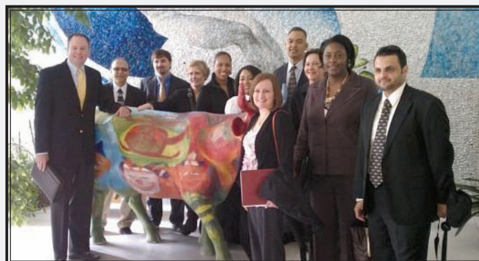
EMSHA Students in Prague

Europe, and enjoyed learning about its organizational structure and quality management initiatives during presentations by clinicians and administrators. The tour concluded with a visit to the FN Motol Emergency Department.