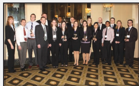
Honorable Mention Teams