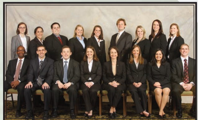
Six Finalist Teams