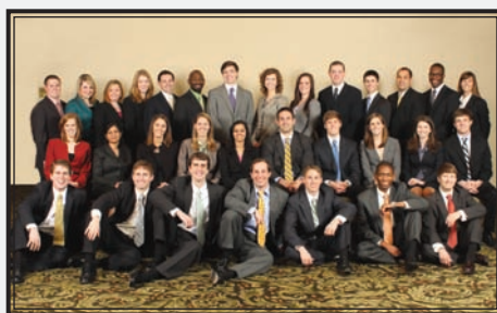
Case Competition Ambassadors