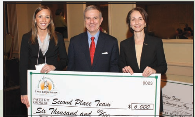
Second Place Team from University of Central Florida