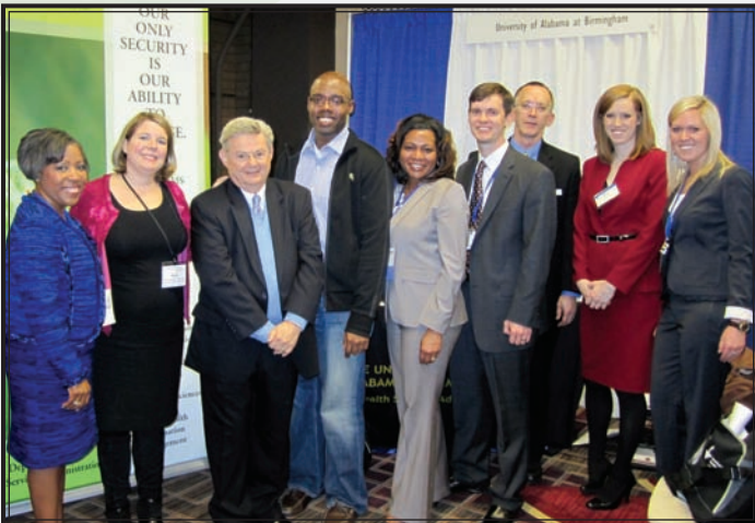
ALUMNI, FACULTY, AND CLASS 46 MEMBERS AT ACHE BOOTH