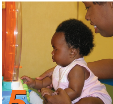
5 Positions for Play