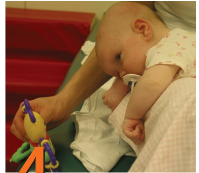
4 Positions for Play