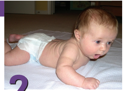
2 More Activities