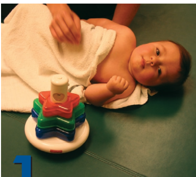
1 Dressing and Bathing