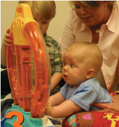
3 Positions for Play