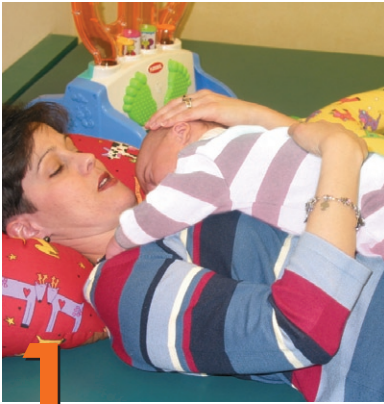
1 Positions for Play