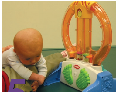
5 More Activities