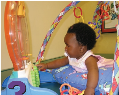
3 More Activities