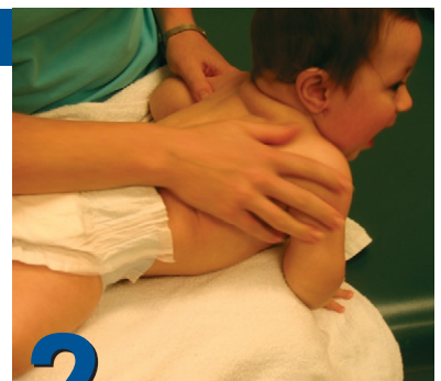
2 Dressing and Bathing