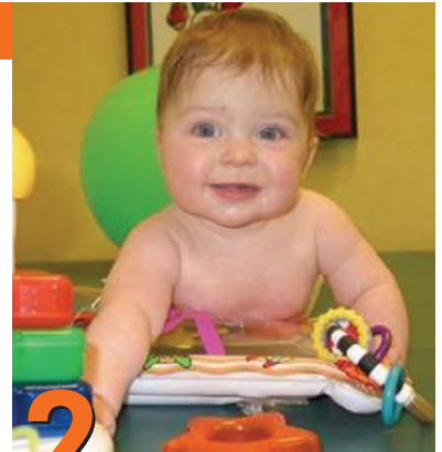
2 Positions for Play