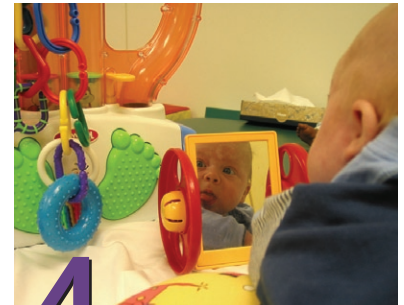
4 More Activities