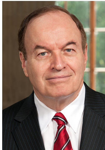
Senator Richard Shelby